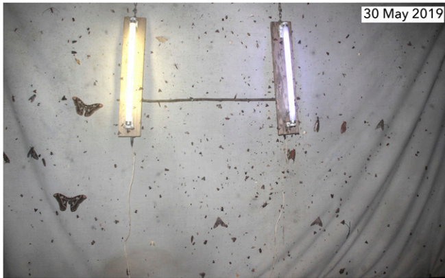
Fig. 5. The same light trap as viewed in Figs. 3 and 4, on 30 May 2019 at the same time in the moon cycle (dark) and 2 wk after the beginning of the rainy season. There are, as usual, two large yellow Eacles (as in SI Appendix, Fig. S2 ) on the ground in front of the white sheet. This dramatic change in moth density and species richness has now come to represent light trap catches in the ACG dry forest at the beginning of the rains (as repeated May 2020), and we have less extreme examples in the ACG cloud and rain forest as well, since about 2014 to 2015.

that self-driven restoration is possible and a normal part of ecosystem dynamics [much as is today's emphasis on optimism about both stopping and mitigating climate change (57)]; 2) enlarged ACG (from 30,000 to 169,000 ha) to where it could sustain most of its biodiversity and tolerate light footprints of its society, by straightforward open market purchase of about 350 properties (3); 3) facilitated ACG to be a government–non-governmental organization (NGO) hybrid to produce nondamaging goods and services indefinitely (also known as sustainably); 4) stimulated it to be self-sustaining in the many currencies it requires and can offer (2–4, 8–10); and 5) constructed it to be a pilot project meant to be transparent to everyone. ACG worked and is still working.