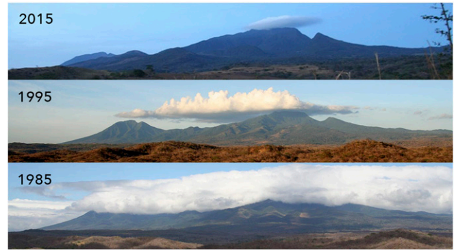
Fig. 2. Clouds of the cloud forest in ACG (red mountaintops in Fig. 1), Volcán Orosí (Left) and Volcán Cacao (Right) as viewed from the Pacific side of Costa Rica. In the 1980s, the standard view was a solid mass of clouds generated by the east-to-west trade winds pushing moist Caribbean air up and over the cordillera (Bottom image). When this air condenses, it creates a foggy and dripping cloud forest on the mountaintops. By the mid-1990s, a common view was a mix of 1980s views and many days with a fractured and much smaller cloud layer (Middle image). This was accompanied by drying forest litter, obvious reduction in epiphyte loads, and frequent reductions in stream flow. Today, there are often days with no clouds at all (Top image), mixed with days of a heavy cloud layer as in the 1980s, but the bottom of that layer is now 100 to 500 m higher in elevation. Heavy fog no longer swirls in through open doors and windows of the Cacao Biological Station at 1,100 m and ants are now a conspicuous part of the fauna at the station, whereas they were essentially absent when ACG was established in the mid-1980s (37, 38) because the soil and litter were too cold and wet for them.

As is the case with tropical mountains everywhere (e.g., ref. 39), the rising hot air mass is evaporating the clouds of the ACG cloud forest (Fig. 2). This subjects the cloud forest biota to hotter and drier environments and for more days each year. It also deprives the lower-elevation species of their mountaintop dry season clouds, the clouds in which many species of insects normally refrigerate themselves in a cold wet environment for the five to six