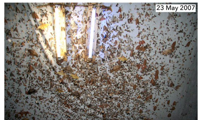
Fig. 4. The same light trap as Fig. 3, 23 y later, same time in the rainy season and moon cycle, with the mass of moths normally present at this time of year since the 1970s. The cinnamon brown endemic Schausiella santarosensis (Saturniidae) are abundant on the right side (the UV-rich blacklight side), and there are the usual omnipresent, yellow, as-yet-undescribed species of Eacles (Saturniidae) (as also visible in SI Appendix, Fig. S2 ).

In 1985, faced with near disappearance of tropical dry forest in Central America (13, 15, 56), we, along with 15,000+ Costa Rican and international donors of cash and sweat equity in many currencies, took on the conspicuous immediate steps for ACG conservation with all of its contained biodiversity, no matter the taxon or assault (10). We and many others 1) knew from natural events